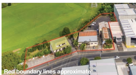
Red boundary lines approximate