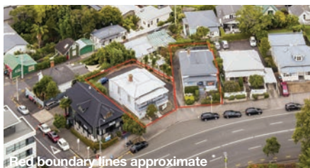
Red boundary lines approximate