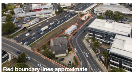
Red boundary lines approximate